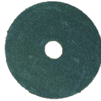
2.5" Flat Washer