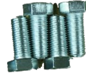
1" x 7/16"x20 Bolts