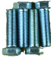
1 1/2" x 7/16"x20 Bolts