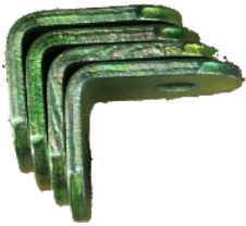
90 Degree Bracket